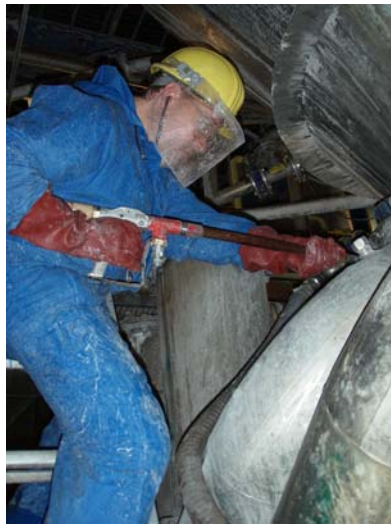
Employee working with the high-pressure pistol