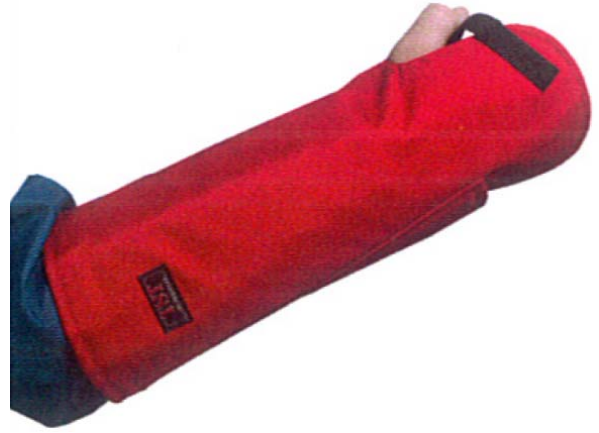
Personal safety equipment for hand and legs (up to 500 bar)