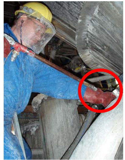
Position when injured