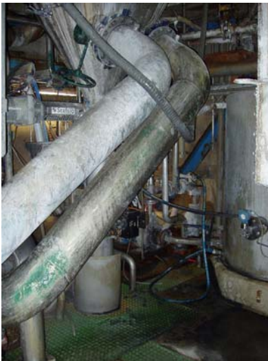
Place of accident