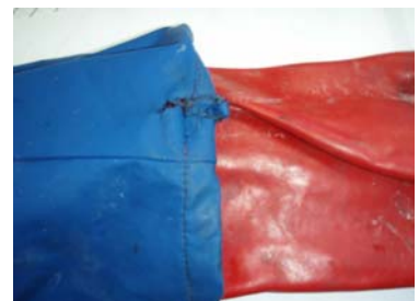
Glove and Overall